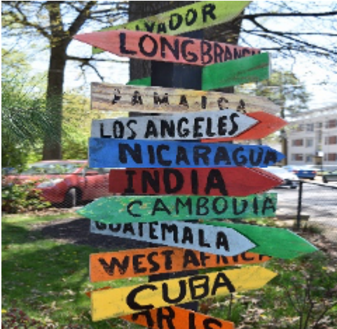
Photo: Long Branch Community in Montgomery county, MD