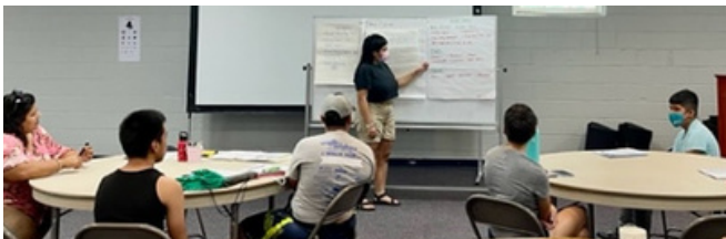
Photos: YPAR Summer program. June-August 2022 Long Branch, Maryland